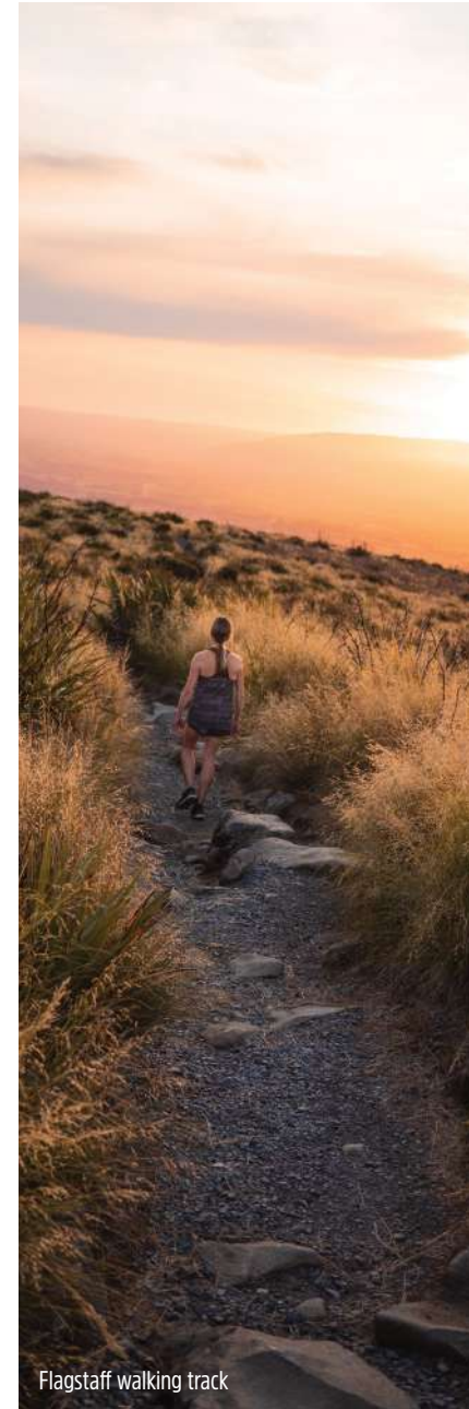
Flagstaff walking track