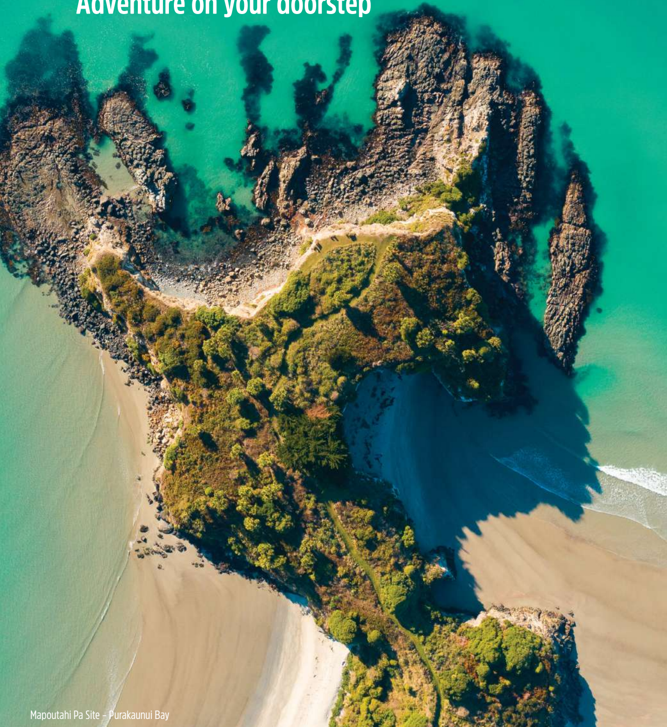
Mapoutahi Pa Site - Purakaunui Bay