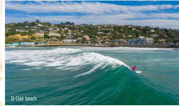
St Clair beach