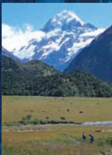
Mt Cook, South Island

Signatory to the Ministry of Education 'Code of Practice for the Pastoral Care of International Students'