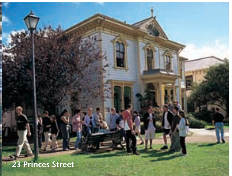
23 Princes Street