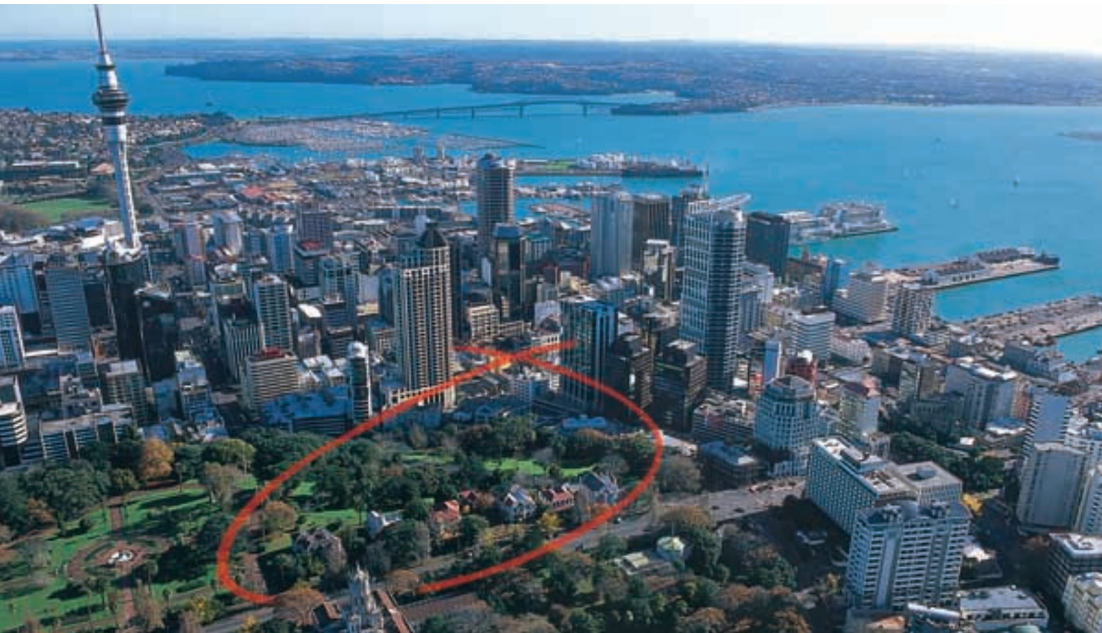
Princes Street and Chancery premises