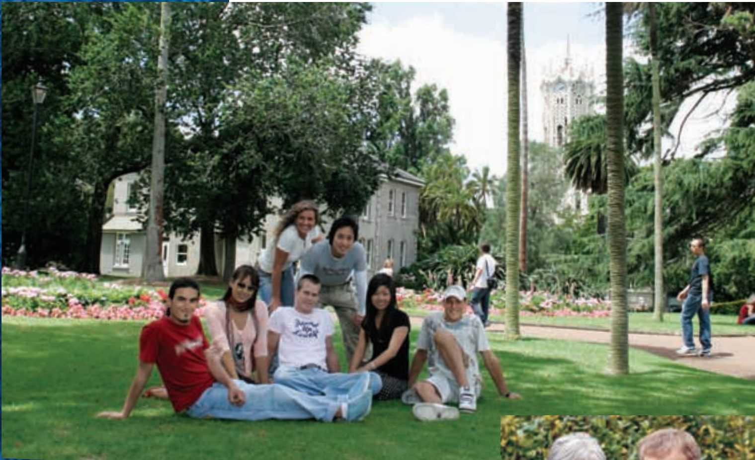
Students behind Languages International Auckland, in Albert Park