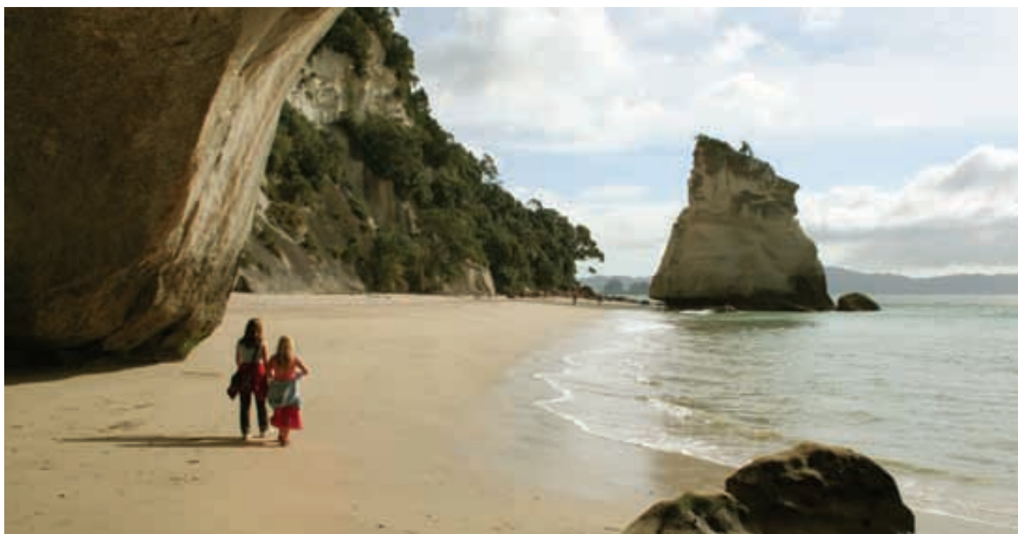
The Coromandel, 90 minutes south of Auckland