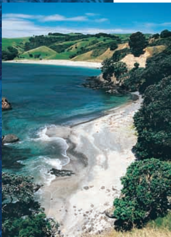
Waiheke Island, 30 minutes from downtown Auckland