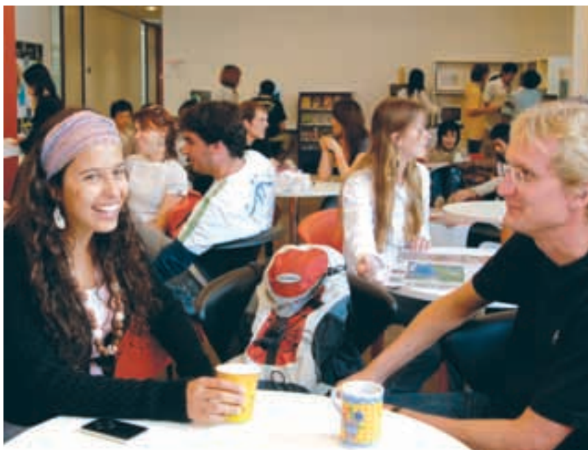
Student Cafeteria, Christchurch