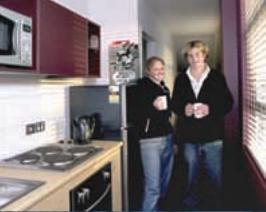
'Living Space' Student Residence, Christchurch

When you stay with one of our host families you will find a welcoming home offering you warmth and security. This is the best way to experience the New Zealand way of life and practise the language you learn at school during the day.