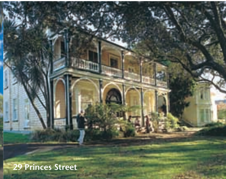
29 Princes Street