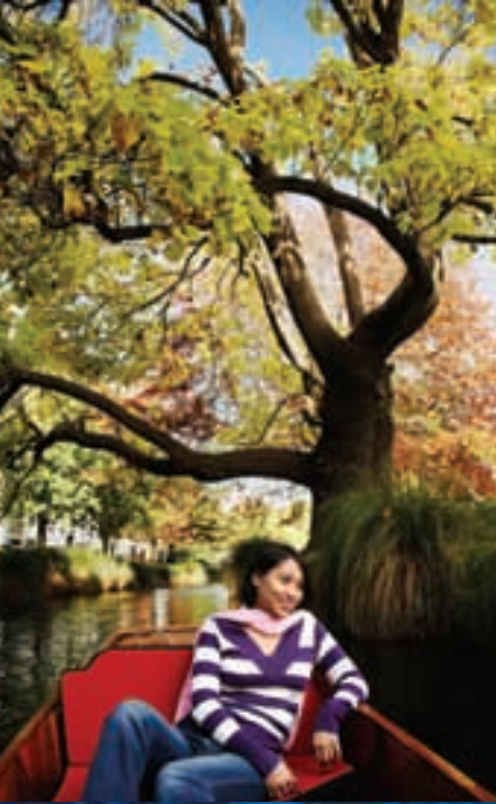
The river Avon is a one-minute walk from school