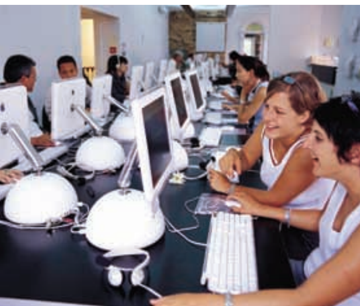
Learning Centre, Auckland