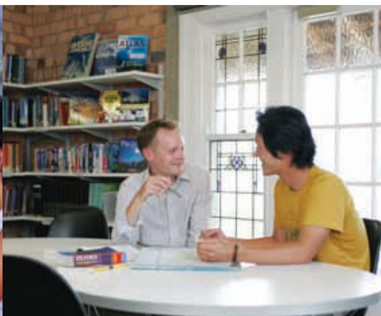
Teachers help students develop personal learning programmes