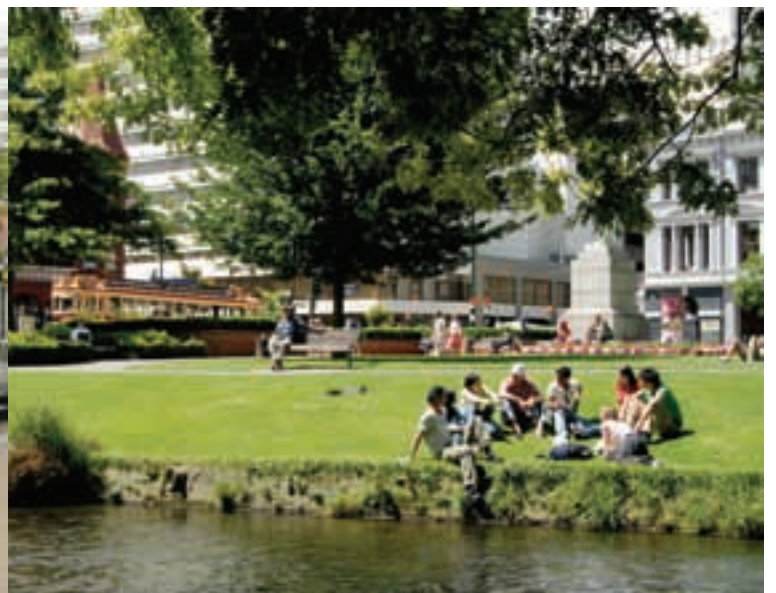
Lunch beside the River Avon near the school