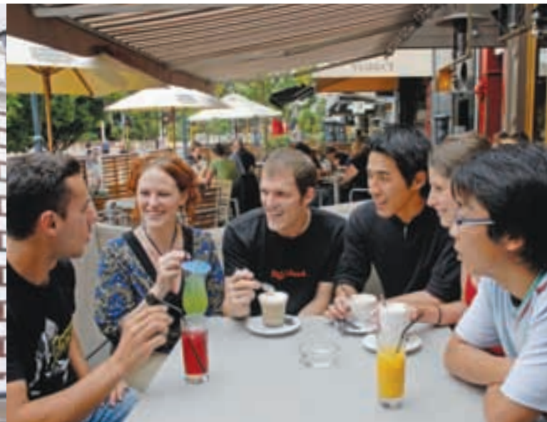
The school is in the heart of the café district