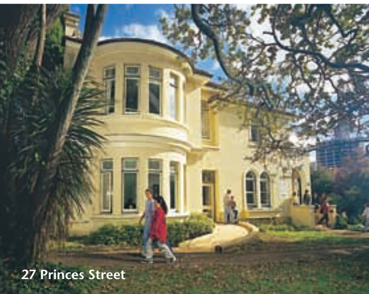
27 Princes Street