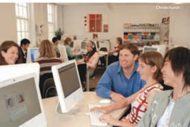
Teachers are always available to help in the Learning Centre

TESOL Course - Training for English Language Teachers from non-English speaking countries.