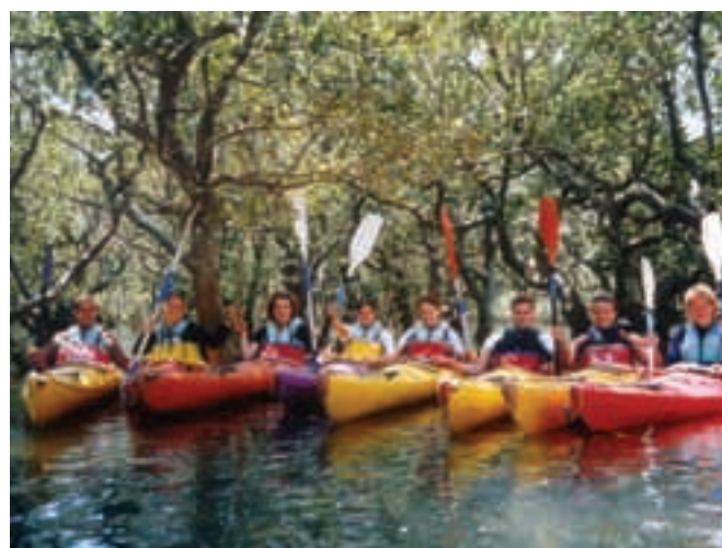
Teachers take part in all school social activities

At the weekends, you can visit a wide variety of sightseeing destinations close to Auckland and Christchurch. There is a selection of both day and overnight excursions. To offer you a wide choice of trips, we work together with carefully selected travel companies. These trips are led by experienced tour guides.