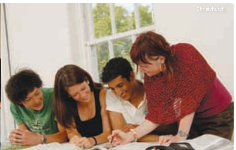
Small classes allow personal attention from teachers