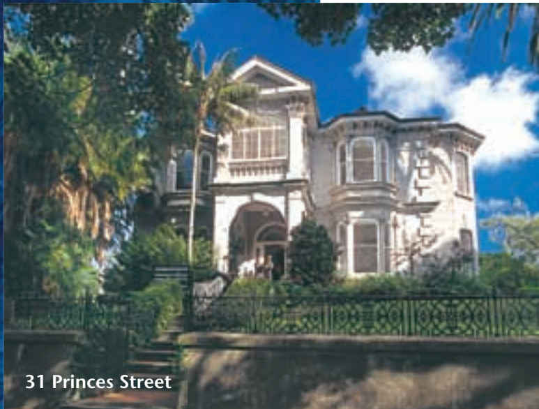
31 Princes Street