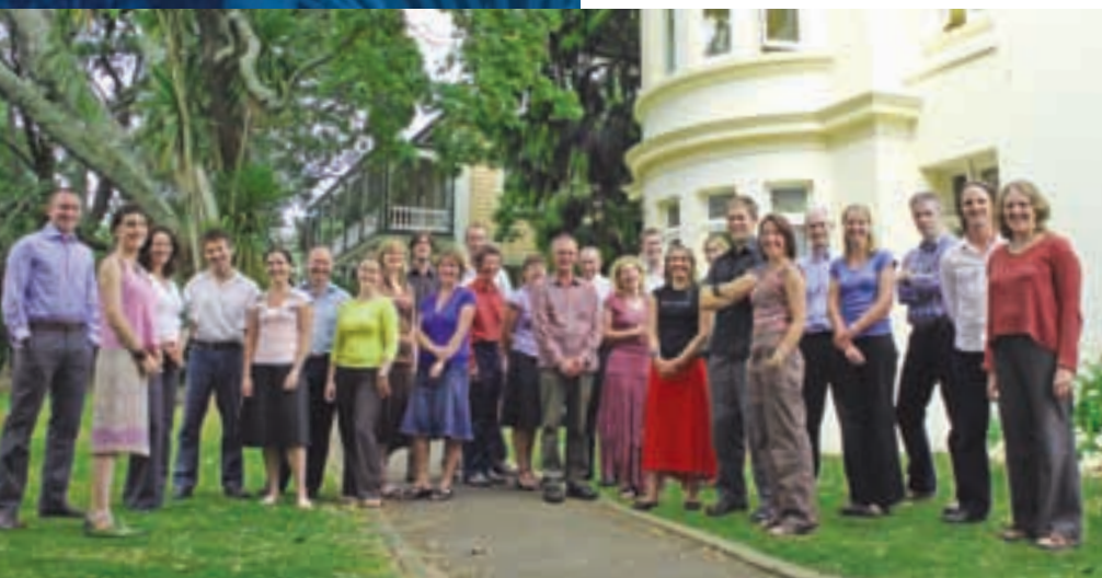
All staff are university graduates and all senior academic staff have Masters degrees in Applied Linguistics