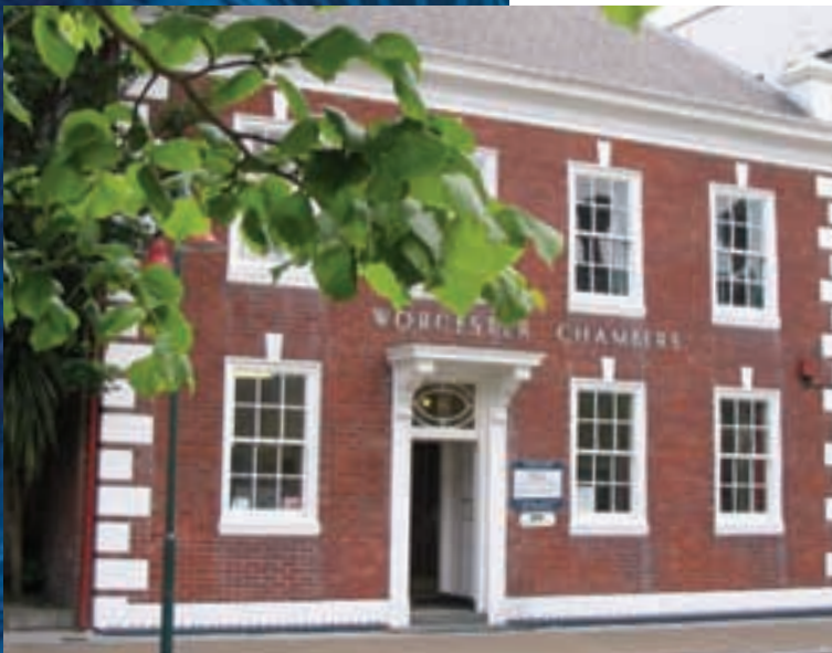
Languages International Christchurch