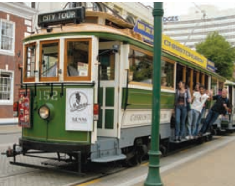
The historic tram passes in front of the school